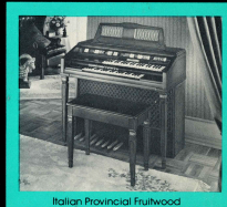
Italian Provincial Fruitwood